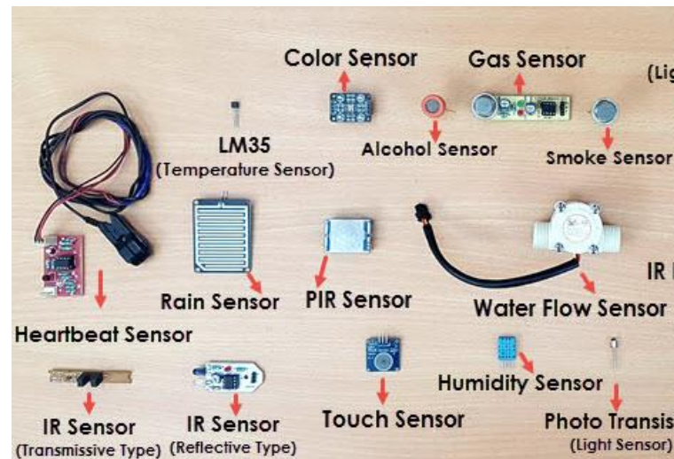
Figure2: Different Sensors